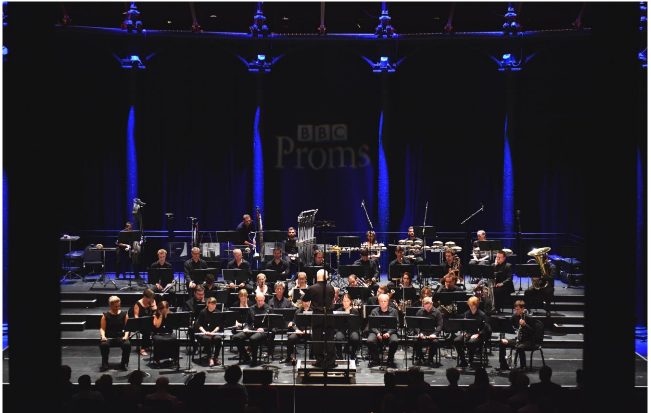
George Benjamin conducts the London Sinfonietta in the BBC PROMS, in association with 1418 NOW, July 2018

The London Sinfonietta is one of the world's leading chamber ensembles, specialising in contemporary classical music and cross arts projects. Formed in 1968, the group quickly developed, and has sustained, a world-wide reputation for its high quality performances of contemporary music, for commissioning new works from the leading composers of the day and for encouraging the finest new talent. It was the first ensembles to develop an education programme in the UK and has continued to explore new and best practice in other areas of its activity including concert curation, training young artists and digital projects. Our ethos today is to constantly explore and experiment with the art-form, commissioning and working with the world's leading composers, conductors and artists, as well as collaborating with artists from other disciplines.