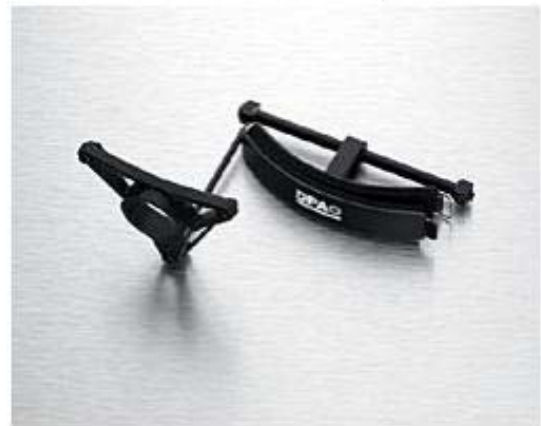
The CH4000 is specially designed for mounting the studio quality Compact Microphones directly on the cello