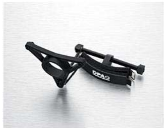
The VH4000 is specially designed for mounting the studio quality Compact Microphones directly on violin, viola or bass