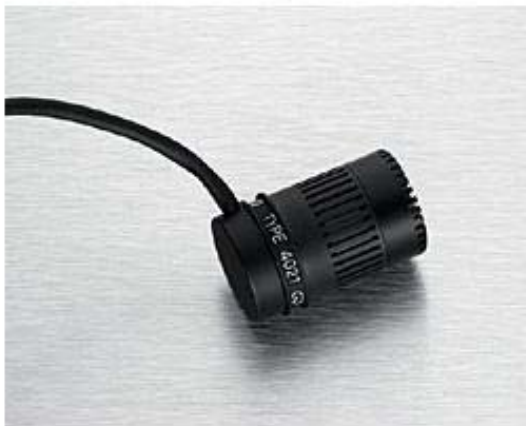
The Type 4021 is a phantom powered (P48) condenser microphone