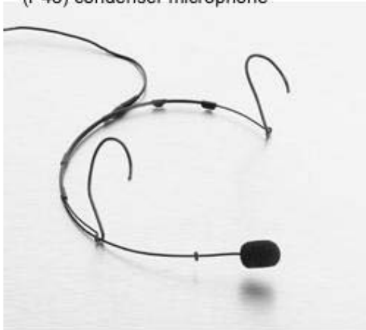
DPA 4088 is a miniature cardioid headband